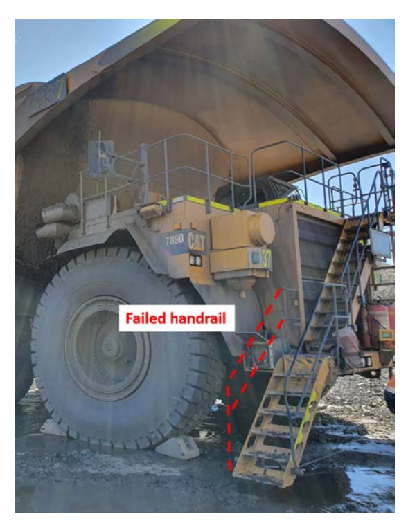
Figure 1 Failed handrail on haul truck

A hand rail on the access ladder of a Caterpillar 789D failed, causing a worker to fall about 1 to 1.5 metres to the ground. The worker sustained serious arm and leg injuries which required surgery.