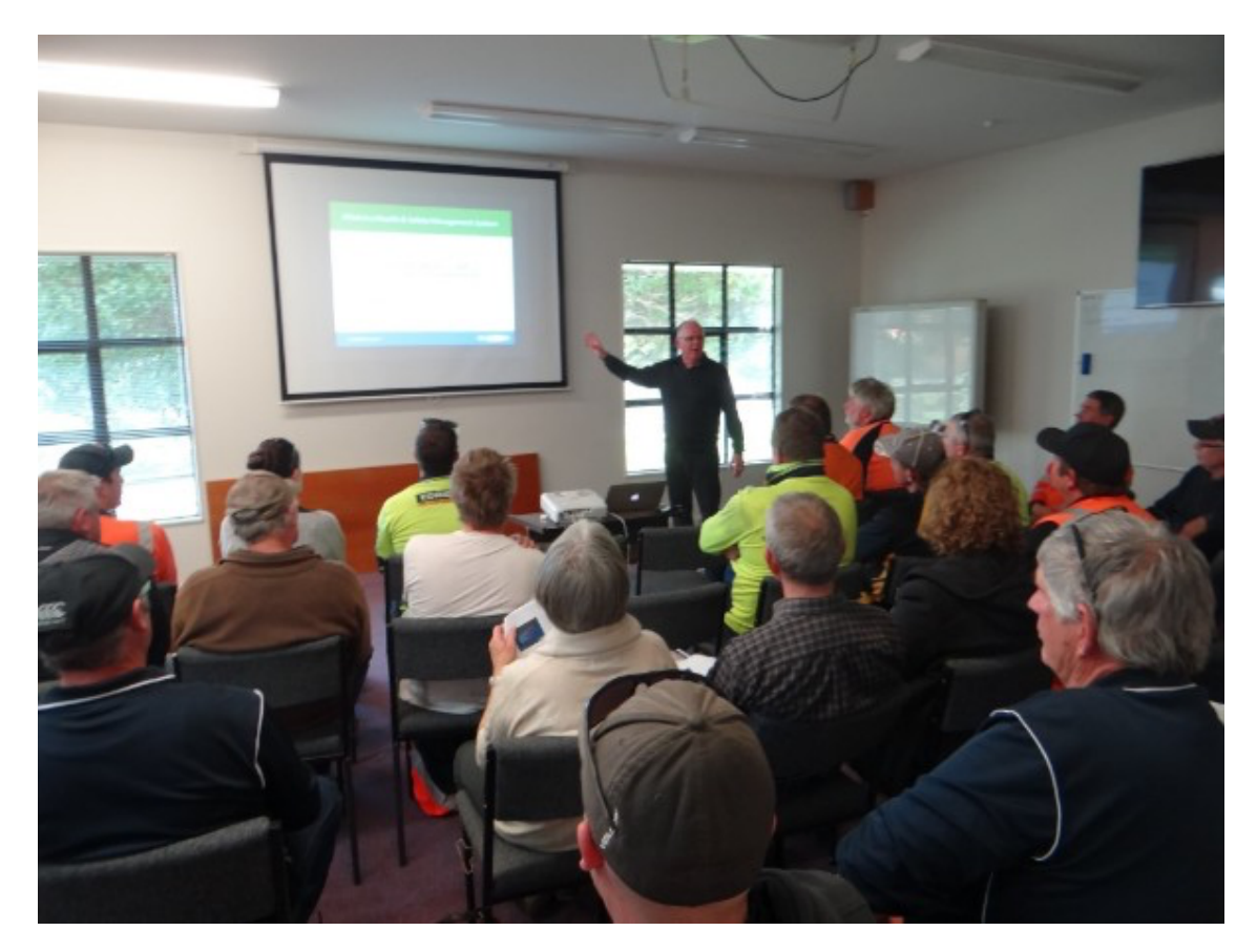
Last year's Blenheim MinEx workshop