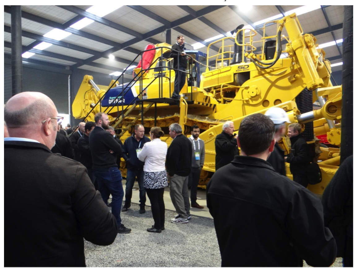
Time to start thinking about conferences such as QuarryNZ