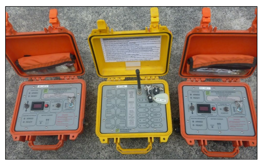
Remote firing devices

Post-blast risk assessment takes place AFTER the shot has been fired. It is essential in order for safe work to resume in the vicinity of the blast and elsewhere within the Blast Exclusion Zone.