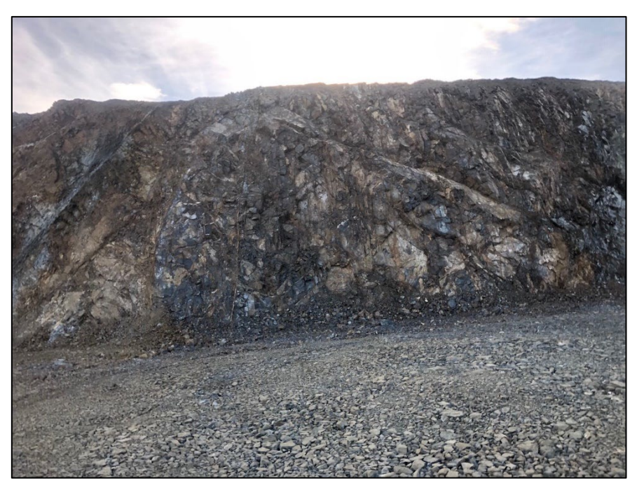
Face should be checked

Effective and safe implementation of the blasting process requires prior planning and scheduling on a daily, weekly, and monthly basis, to ensure that blasting activities can be carried out safely within required timeframes.