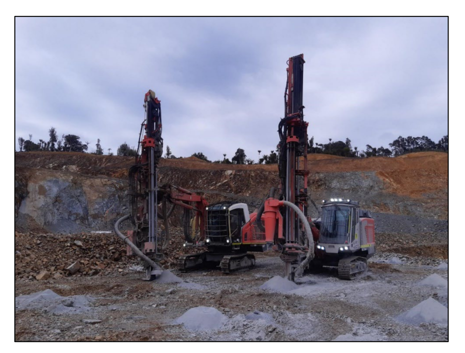
Drill rigs working on a bench