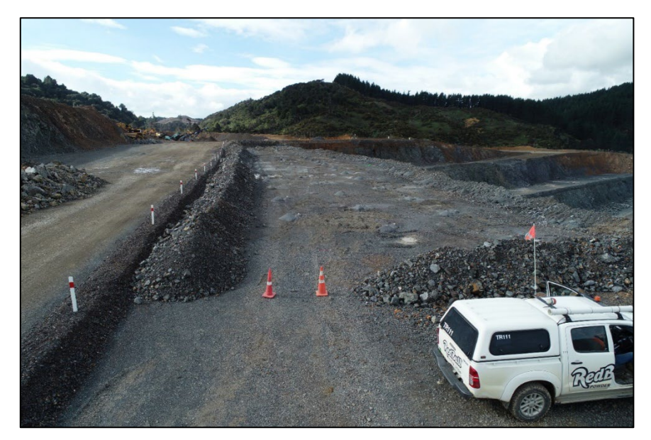
Bench preparation with limited access