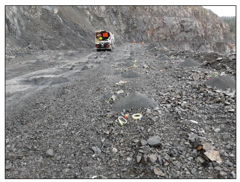
Blast holes being charged

The charging and stemming process requires close attention to quality control, in terms of charge quantities, column rise, and stem height. Equally important is the need for safe on-bench traffic management, in terms of the interaction between equipment and personnel and the use of large equipment close to charged blastholes and initiating explosives.